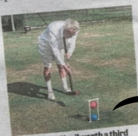
Victory gave Kenilworth a third straight title.

www.ktscc.co.uk/croquetfor more info on the club and the sport.