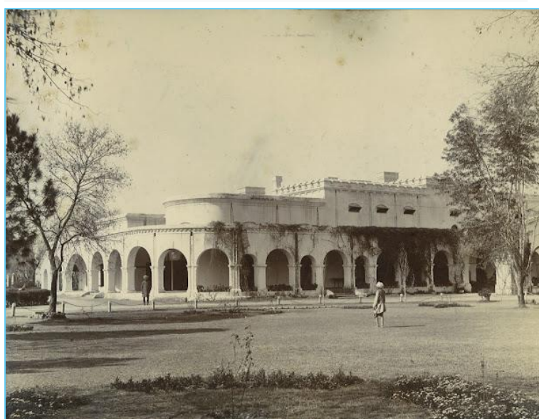
The Rawalpindi Sports Club c1890s

During the early 1930s, sports played an essential role in regimental life and community bonding in the area. Notable sporting achievements and events mentioned in Army Championships from that era include Point to Point Meetings, Hockey, Tug-of-War 1930, Boxing 1930, with champions named as members of military regiments stationed in the area: 1 st Battalion, 6 th Battalion, Territorial Army. These glimpses into the sporting achievements of the time highlight the camaraderie, dedication, and competitive spirit of military personnel and sports enthusiasts in Rawalpindi during the 1930s.