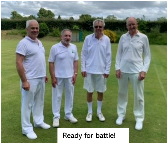
Ready for battle!